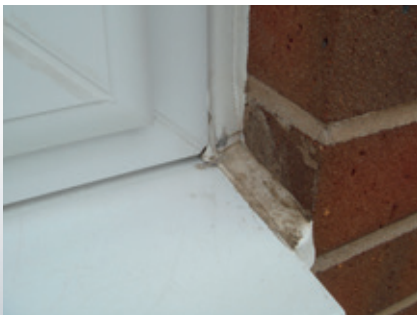
Unsightly & non energy efficient window installation