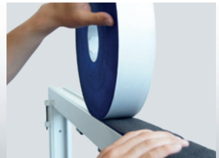
Fit seal to window, fit window to wall