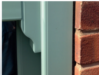
Perfect sealing with ISO-BLOCO WIN2WALL