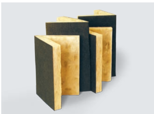
ISO-ACOUSTIC INSULATING STRIPS in sheets with V-Cut for optimal fitting