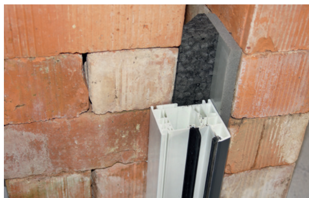
Installation example: ISO-BLOCO FILLER