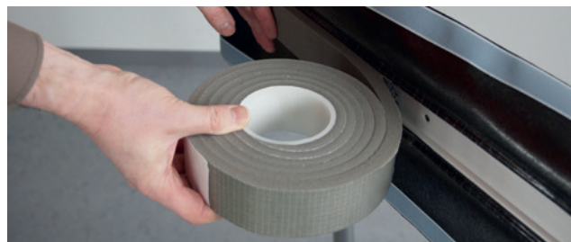
Installation example: ISO-BLOCO HF

* On the conditions of the manufacturer (available on request).