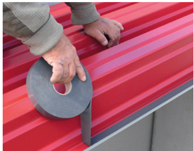
Installation example: ISO-ZELL FIX-TAPE