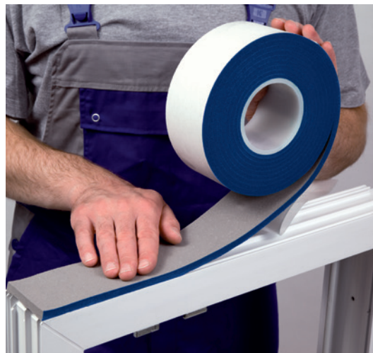
Installation example: ISO-BLOCO MULTI-FUNCTIONAL TAPE

* Movement of the components and temporary changes of length of the existing joints should be taken into account when determining the right strip size.