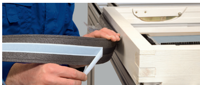
Installation example (1-BT): Fitting wooden windows