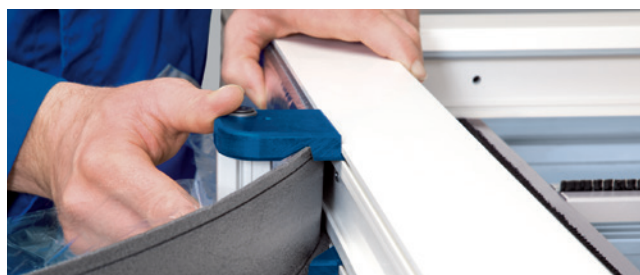
Installation example (CB): Fitting PVC windows

*** Available tape widths correspond to current price lists.