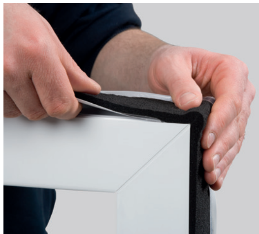
Installation example: ISO-BLOCO ONE

*** Movement in structural elements and temporary longitude changes are to be taken into account by the max. joint width.